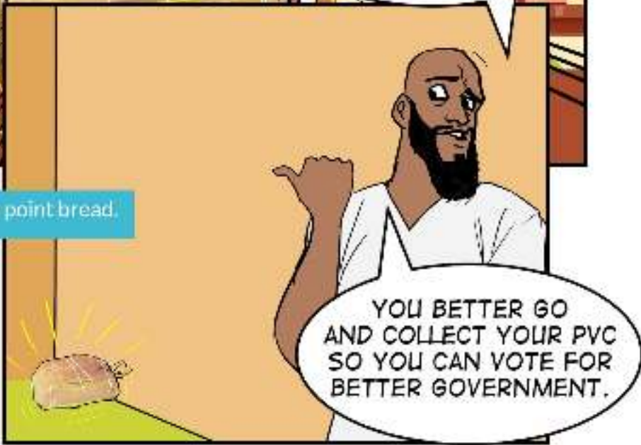
Adams can dey point bread.

YOU BETTER GO AND COLLECT YOUR PVC SO YOU CAN VOTE FOR BETTER GOVERNMENT.