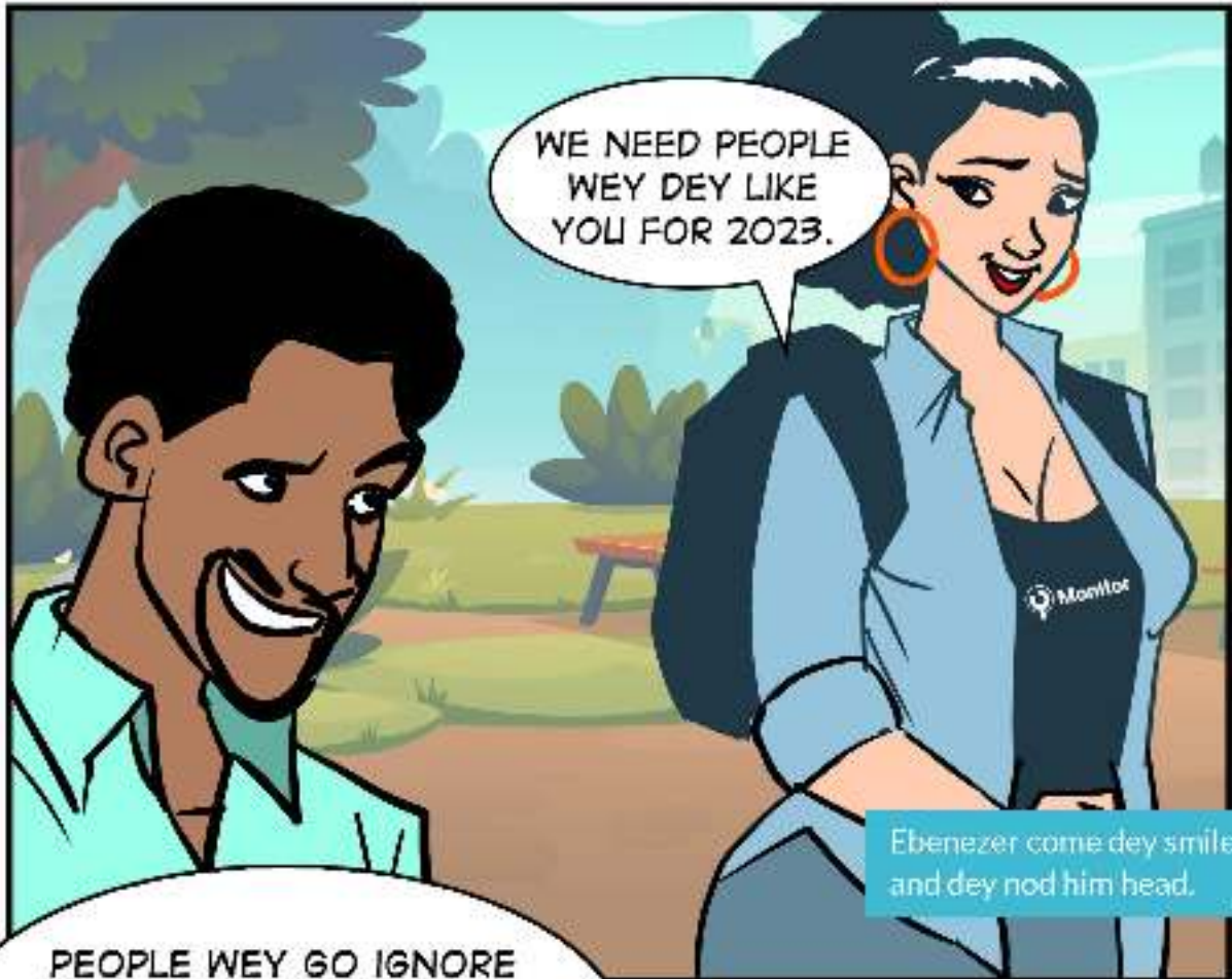
Ebenezer come dey smile and dey nod him head.