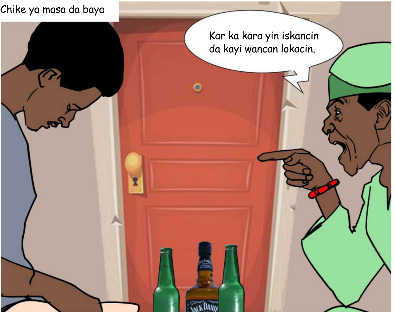
Kar ka kara yin iskancin da kayi wancan lokacin.