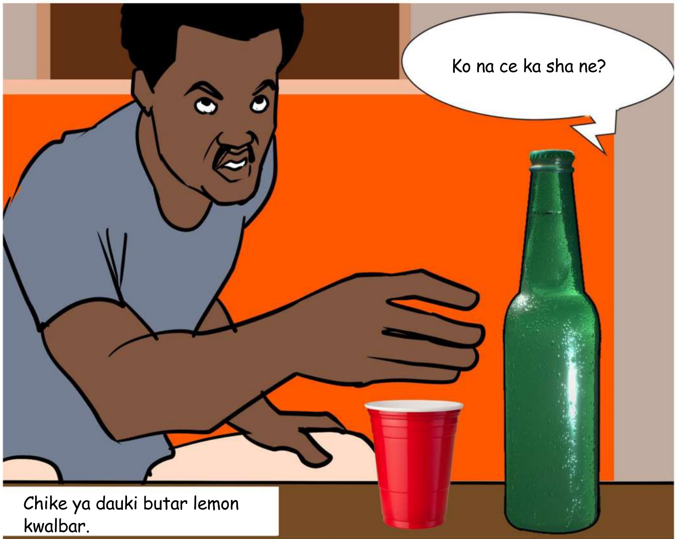
Chike ya dauki butar lemon kwalbar.