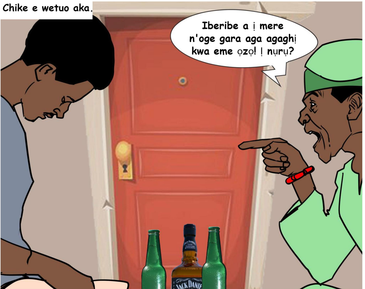
Chike e wetuo aka.